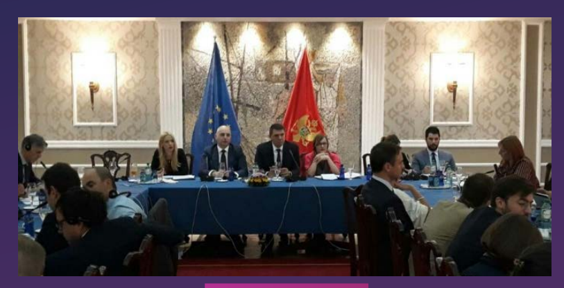
19. VII 2018.